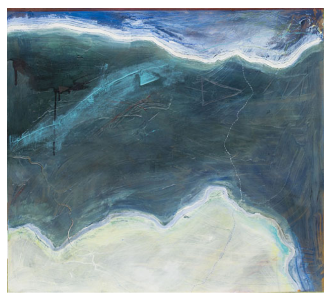
Figure 4. Jacqueline Scotcher, 2015, Wayfaring No.3, synthetic polymers on canvas in Scotcher (2018, 45).

In the paintings, lines oscillated from macroscale and microscale, floating mercurially in one's imagination and forming a mountain range at one time and the path of a