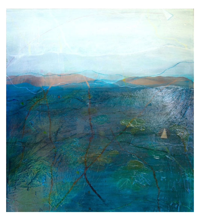
Figure 8. Jacqueline Scotcher, 2017, Hinchinbrook Island Walk No.2, synthetic polymers on canvas in Scotcher (2018, 71).