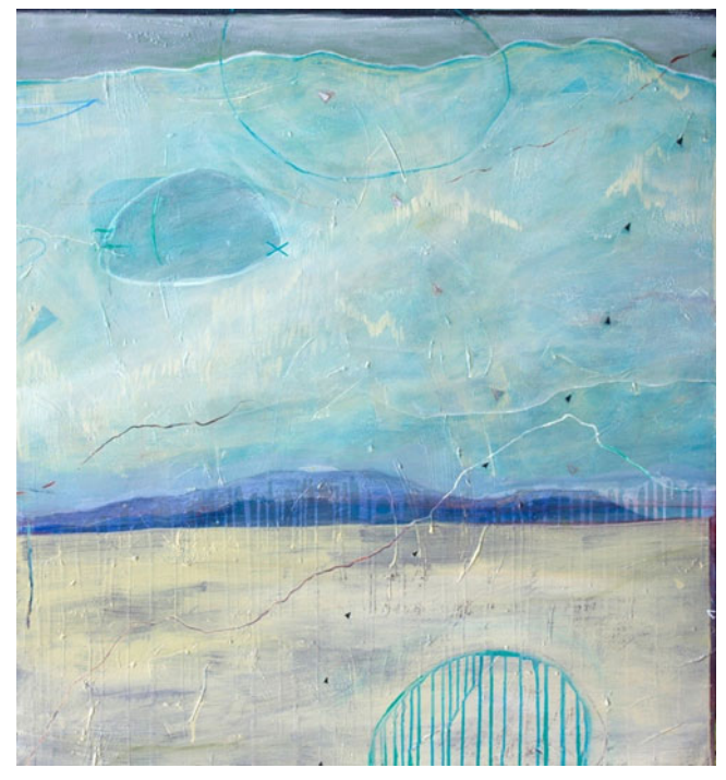
Figure 7. Jacqueline Scotcher, 2017, Hinchinbrook Island Walk No.1, synthetic polymers on canvas in Scotcher (2018, 71).