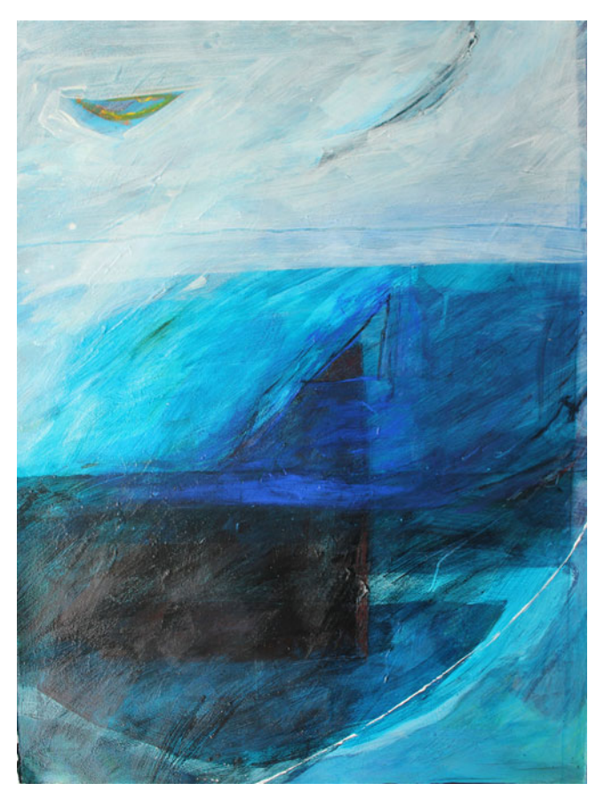
Figure 3. Jacqueline Scotcher, 2014, View from the top of Earl Hill No.2, synthetic polymers on paper in Scotcher (2018, 28).

In the second phase of the research Scotcher reviewed literature in the fields of phenomenology, nature, walking and body-mapping to expand her contextual knowledge.